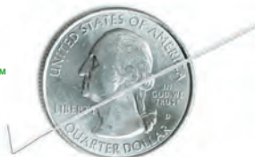
MICROLEAD™ (ACTUAL SIZE)

Ask your doctor if the SPRINT System is right for you.